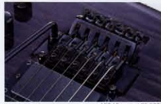
ART-1 Tremolo (LBE-CST)

This fine tuning tremolo system was designed and licensed by Floyd Rose, the master of tremolo systems. The main block is made of heavy brass which produces superior sustain and tone. The special double locking feature provides precise tuning adjustments and absolute tuning