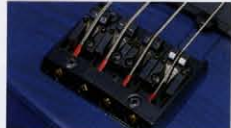
SAB-1 Tailpiece (LBB-CST)

The SAB-1 Tailpiece fitted to the Libra Bases has been designed to allow the musician to obtain perfect intonation and tuning. The adjustable bridge saddles are very stable and allow a 16mm (narrow) to an 18mm (wide) string spacing. The SAB-1 provides superior overall performance and excellent sustain.