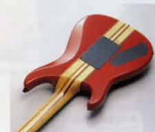
Neck Through Body (WR-1003)

The Aria Technique is producing the five piece walnut and maple neck through the body system, gives the guitar better stability and easier access to the higher fret positions. The heel-less cutaway along with the ebony fingerboard combines to create a neck with excellent feel and playability.