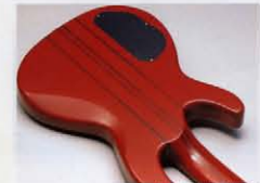
Neck Through Body (IGB-65)

As featured previously only in the SB 1000 Super Bass, Aria Pro II now offers their unique through neck body neck joint in the IGB-65. Aria Pro II Through Neck is 5 piece lamination of maple/walnut fused through the body to provide effortless access to the highest fret.