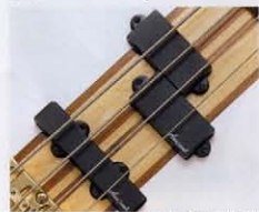
CJ-1/CJ-1 P.U. (IGB-65)

The IGB Integra Bases are equipped with Aria's CP-1 and CJ-1 ceramic magnetic pickups. These pickups provide outstanding frequency response and a wide variety of tonal variations from which the player may choose his own unique sound.