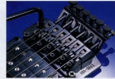
TRS-101 Tremolo (VA-453)

The new TRS-101 Tremolo System has many innovations, resulting in easier string changing, fewer broken strings, and greater stability during prolonged use. Tuning and intonation problems have been eliminated, allowing the player to "Dive Bomb" with confidence.