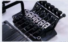
TRS-101 Tremolo (CT-CT2)

The ACT-2X Tremolo unit is a simple, reliable design that affords smooth, easy arm movements with