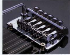
KKT-1 Tremolo SL-DX-3

This rugged fine tuning tremolo system with string locking nut is standard equipment on SL-DX-3 model. Dive with the best and still come back in tune.