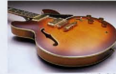
Arched Top (TA-DLX)

The semi-hollow body and arched top of the TA series develop a full, rich tone in all registers. Both the TA-DLX and TA-STD feature a center block construction which allows higher volume levels with feedback and greatly increases sustain.