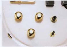
Active Control (PRB-60)

The PRB-60 Active control is designed specifically for high impedance passive pickups and offers a wide range of tones by boosting the high and mid frequencies through a front and rear pickup mix.