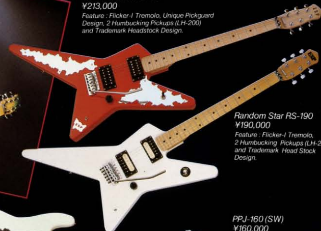
Random Star RS-190 ¥190,000

Feature: Flicker-I Tremolo, 2 Humbucking Pickups (LH-200) and Trademark Head Stock Design.