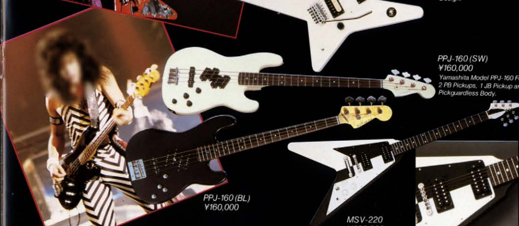
PPJ-160 (BL) ¥160,000

Yamashita Model PPJ-160 Feature: 2 PB Pickups, 1 JB Pickup and Pickguardless Body.