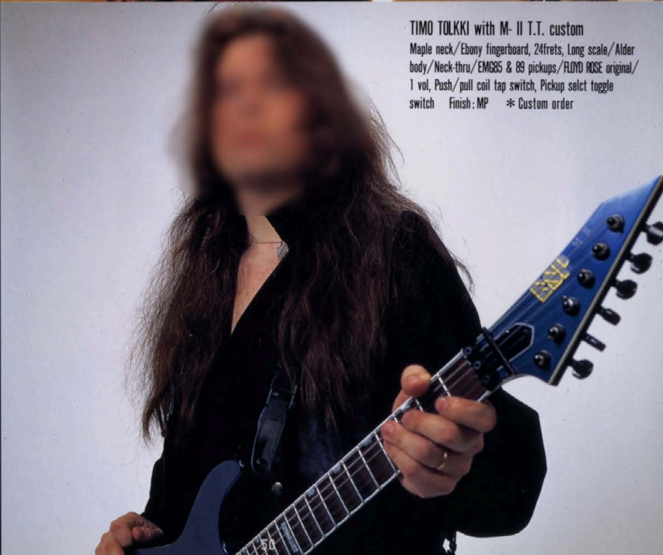
TIMO TOLKKI with M-II T.T. custom Maple neck/Ebony fingerboard, 24frets, Long scale/Alder body/Neck-thru/EMG85 & 89 pickups/LOYD ROSE original/ 1 vol, Push/pull coil tap switch, Pickup select toggle switch Finish:MP * Custom order