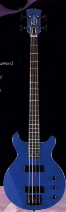
EJ-78TV BODY : Alder NECK : Maple / Rosewood PICKUPS : EDWARDS Original Wide Type BRIDGE : Custom Bass Bridge FINISH : JBK, JR, JB PRICE : 78,000 yen