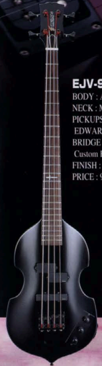
EJV-95 BODY : Alder NECK : Maple / Rosewood PICKUPS : EDWARDS Original BRIDGE : Custom Bass Bridge FINISH : BK PRICE : 95,000 yen