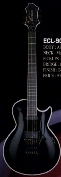
ECL-90-II BODY : Alder NECK : Maple / Rosewood PICKUPS : ES-I, EH-I BRIDGE : Floyd Rose Original FINISH : BK PRICE : 90,000 yen