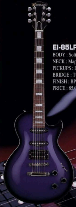
EI-85LP-III BODY : Soft Maple NECK : Maple / Rosewood PICKUPS : ES-I, EH-I BRIDGE : Tune Matic FINISH : BPS PRICE : 85,000 yen