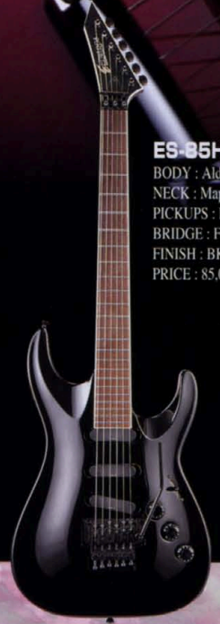
ES-85HR-IV BODY : Alder NECK : Maple / Rosewood PICKUPS : ES-I BRIDGE : Floyd Rose Original FINISH : BK PRICE : 85,000 yen