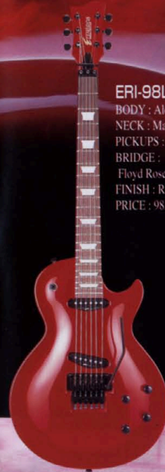
ERI-98LP BODY : Alder NECK : Maple / Rosewood PICKUPS : ES-1 BRIDGE : Floyd Rose Original FINISH : Rika R PRICE : 98,000 yen