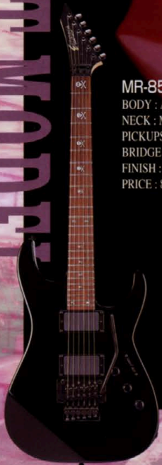
MR-85M BODY : Alder NECK : Maple / Rosewood PICKUPS : EH-1 BRIDGE : Floyd Rose Original FINISH : BK PRICE : 85,000 yen