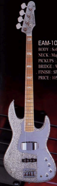
EAM-105 BODY : Soft Maple NECK : Maple / Maple PICKUPS : JSQ-100 BRIDGE : Wide Type FINISH : SPK SI PRICE : 105,000 yen