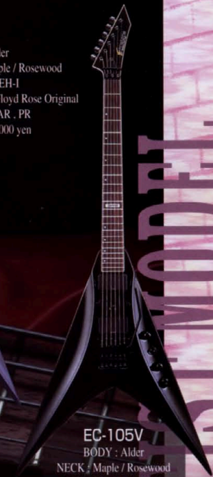
EC-105V BODY : Alder NECK : Maple / Rosewood PICKUPS : ES-1 , EH-1 BRIDGE : Floyd Rose Original FINISH : BK PRICE : 105,000 yen