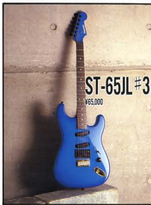
ST-65JL #3 ¥65,000

NECK/Maple FINGER BOARD/Rosewood, 350R, 22F, 25.50" Scale NECK JOINT/Detachable BODY/Alder PICKUP/DS-2(front, center), VH-6(rear) CONTROL/1V BRIDGE/Combination-GL COLOR/PS