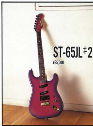
ST-65JL #2 ¥65,000

NECK/Maple FINGER BOARD/Rosewood, 350R, 21F, 25.50" Scale NECK JOINT/Detachable BODY/Alder PICKUP/DS-1(front, center), VH-3J(rear) CONTROL/1V BRIDGE/Combination-B&C COLOR/H