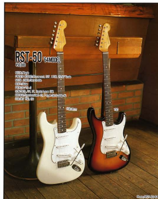
RST-50 '64MODEL ¥80,000

NECK: Maple FINGER BOARD: Rosewood, 21F, 170R, 25.50" Scale NECK JOINT: Detachable BODY: Alder PICKUP: VS-1 CONTROL: 1V, 2T, 5point Lever SW BRIDGE: Symmetrical-Dr, Oil Saddle-N, (Hertz Iron Block) COLOR: YSO CH