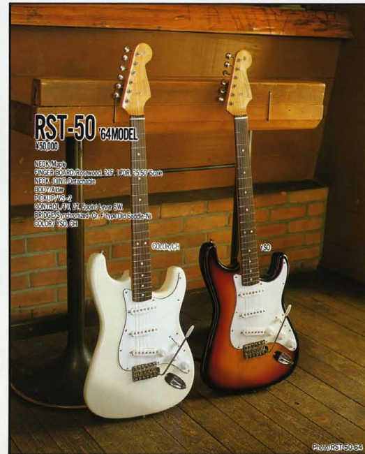
RST-50 '64MODEL ¥50,000

NECK: Maple FINGER BOARD: Rosewood, 21F, 170R, 25.50" Scale NECK JOINT: Detachable BODY: Alder PICKUP: VS-2 CONTROL: 1V, 2T, 5point Lever SW BRIDGE: Synchronized-Cr, Old Saddle-Ni, (Inertia Iron Block) COLOR: OS, GR