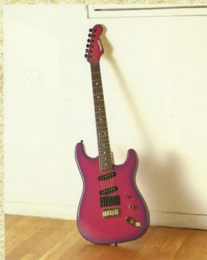
ST-60JL #2 ¥60,000

NECK/Maple FINGER BOARD/Rosewood 22F, 25.50" Scale NECK JOINT/Flush BODY/Basswood PICKUP/V5 (front, center), VH1 (rear) CONTROL/Volume, Sway Lever SW BRIDGE/Combustion-CL COLOR/SLW