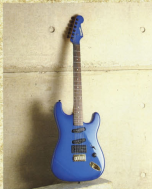
ST-60JL #3 ¥60,000

NECK/Maple FINGER BOARD/Rosewood 25.0R, 22F, 25.50" Scale NECK JOINT/Flush BODY/Basswood PICKUP/V5 (front, center), VH1 (rear) CONTROL/Volume, Sway Lever SW BRIDGE/Combustion-CL COLOR/PS