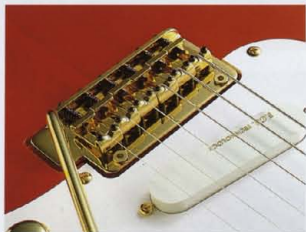
D.E.T. TREMOLO SYSTEM