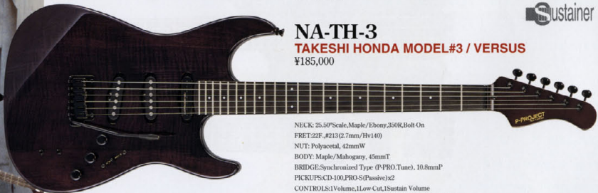
NA-TH-3 TAKESHI HONDA MODEL#3 / VERSUS ¥185,000

NECK: 25.50" Scale, Maple / Ebony, 350R, Bolt-On FRET: 22F, #213(G, 7mm / Hv140) NUT: Polyacetal, 42mmW BODY: Maple / Mahogany, 45mmT BRIDGE: Synchronized Type (P-PRO, Tune), 10.8mmP PICKUPS: CD-100, PRO-S (Passive) x2 CONTROL: Volume, 1 Low-Cut, 1 Sustain Volume SELECTOR: 5 Way Lever SW, Sustainer Mode SW & On / Off SW FUNCTION: All Sustainer Circuit Automatically choose Rear PU FEATURES: Single Sustainer System COLOR: STB, STG HARDWARE: BL