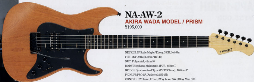
NA-AW-2 AKIRA WADA MODEL / PRISM ¥195,000

NECK: 25.50" Scale, Maple / Ebony, 350R, Bolt-On FRET: 22F, #213(G, 7mm / Hv140) NUT: Polyacetal, 42mmW BODY: Honduras Mahogany 2PLY, 45mmT BRIDGE: Synchronized Type (P-PRO, Tune), 10.8mmP PICKUPS: PRO-SA (Active) x3, SH-4JB CONTROL: Volume, 1 Tone, 5 Way Lever SW, 3 Way Mini SW FUNCTION: 3 Way SW, choose / Active, 3 Single-Front Mix Mode / Active/3 Mode / Passive JB Mode FEATURES: P-PRO, Original / 4 Pick-Up Circuit System COLOR: N HARDWARE: BL