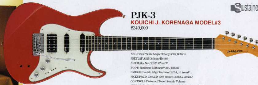
PJK-3 KOUICHI J. KORENAGA MODEL#3 ¥240,000

NECK: 25.50" Scale, Maple / Ebony, 350R, Bolt-On FRET: 22F, #213(G, 0mm / Hv140) NUT: Roller Nut / RN-2, 42mmW BODY: Honduras Mahogany 2P, 45mmT BRIDGE: Double Edge Tremolo D/E-1, 10.8mmP PICKUPS: CD-100F, CD-100F (midPU only), Classic57 CONTROL: Volume, 1 Tone, 1 Sustain Volume SELECTOR: 5 Way Lever SW, Sustainer Mode SW & On / Off SW FUNCTION: Tone Pot SW, choose / Rear Tap / Front Mix Mode FEATURES: Sustainer System (P-PRO, Tune) COLOR: CAR HARDWARE: CR