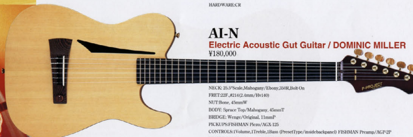
AI-N Electric Acoustic Gut Guitar / DOMINIC MILLER ¥180,000

NECK: 25.5" Scale, Mahogany / Ebony, 250R, Bolt-On FRET: 22F, #214(G, 4mm / Hv140) NUT: Bone, 45mmW BODY: Spruce Top / Mahogany, 45mmT BRIDGE: Wenge / Original, 11mmP PICKUPS: FISHMAN Piezo / AGX 125 CONTROL: Volume, 1 Treble, 1 Bass (Prese Type / inside backpanel) FISHMAN Preamp / AGP 2P FEATURES: Nylon Strings with FISHMAN Piezo System COLOR: N HARDWARE: GL