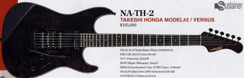
NA-TH-2 TAKESHI HONDA MODEL#2 / VERSUS ¥195,000

P-PROJECTはプレイヤーからのアイデア/リクエストを視点を以て常に新たなアイテムとクオリティをリサーチします。Playerとふれあい、対話する中から生まれたプロスペックモデル。まさしくプロユースを誇るラインナップが本カタログに登場しました。