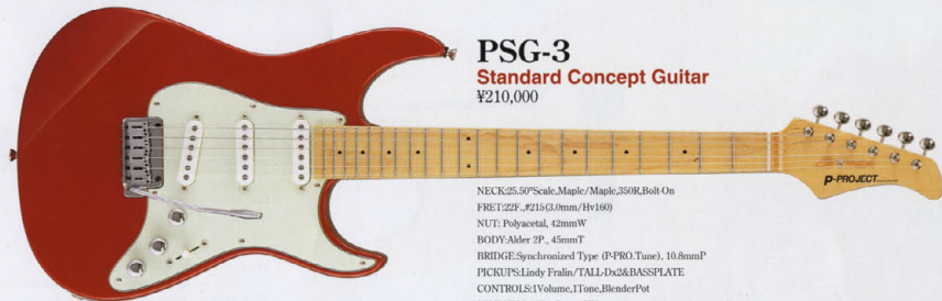
PSG-3 Standard Concept Guitar ¥210,000

NECK:25.50"Scale,Maple/Ebony,350R,Bolt On FRET:22F.#215(3.0mm/Hv140) NUT:Polycrystal,42mmW BODY:Alder 2F.,45mmT BRIDGE:Synchronized Type (P-PRO.Tune),10.8mmP PICKUPS:EMG-SAG2,Duncan TB-4JB CONTROLS:1Volume,1Tone,5Way Lever SW.& Quadro Circuit FUNCTION:Tone Pot SW,choose/Active Gain Rear Tap 3S Mode / Passive Gain SSH Mode FEATURES:P-PRO/Quadro Circuit System COLOR:TRU! HARDWARE:BL