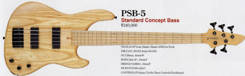
PSB-5 Standard Concept Bass ¥240,000

NECK:34.00"Scale,Maple/Ebony,350R,Bolt On FRET:24F.#213(2.7mm/Hv140) NUT:Bone,43mmW BODY:Maple/Mahogany/Maple,48mmT BRIDGE:PP-501,18mmP (Adjustable±1.0mm) PICKUPS:PRO-J2/Activex2 CONTROLS:2Volume(DoublePot),1Tone,Treble/Bass Controls(DoublePot) SELECTOR:Preamp Bypass SW FEATURES:18V Spec. TC-9500 Active Tone Control COLOR:N HARDWARE:BL