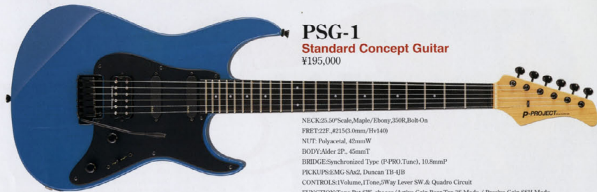
PSG-1 Standard Concept Guitar ¥195,000

NECK:25.50"Scale,Maple/Ebony,350R,Bolt On FRET:22F.#215(3.0mm/Hv140) NUT:Polycrystal,42mmW BODY:Alder 2F.,45mmT BRIDGE:Synchronized Type (P-PRO.Tune),10.8mmP PICKUPS:EMG-SAG2,Duncan TB-4JB CONTROLS:1Volume,1Tone,5Way Lever SW.& Quadro Circuit FUNCTION:Tone Pot SW,choose/Active Gain Rear Tap 3S Mode / Passive Gain SSH Mode FEATURES:P-PRO/Quadro Circuit System COLOR:TRU! HARDWARE:BL