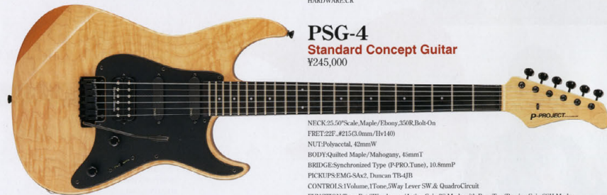
PSG-4 Standard Concept Guitar ¥245,000

NECK:25.50"Scale,Maple/Maple,350R,Bolt On FRET:22F.#215(3.0mm/Hv160) NUT:Polycrystal,42mmW BODY:Alder 2F.,45mmT BRIDGE:Synchronized Type (P-PRO.Tune),10.8mmP PICKUPS:Lady Fralin/TALL.Dc&BASSPLATE CONTROLS:1Volume,1Tone,BlenderPot SELECTORS:5Way Lever SW FUNCTION:Blendermake Front&Rear Mixed Balance FEATURES:Lady Fralin/Blender Passive Circuit COLOR:CAR HARDWARE:CR