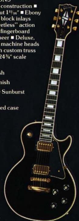
LES PAUL CUSTOM