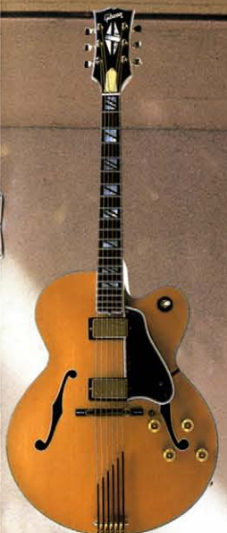
Super V CES