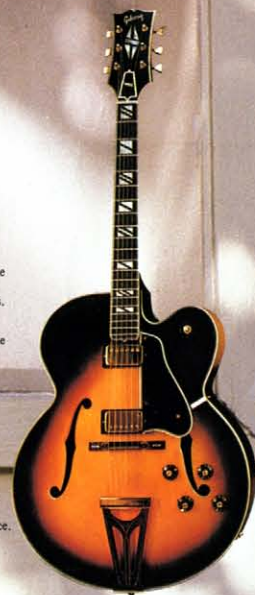
Super 400 CES