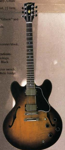
ES 335 Dot

Finish: Cherry, Ebony, Alpine White, Vintage-Sunburst.