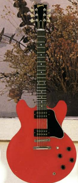
ES 335 Studio