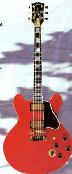
B.B. King Custom