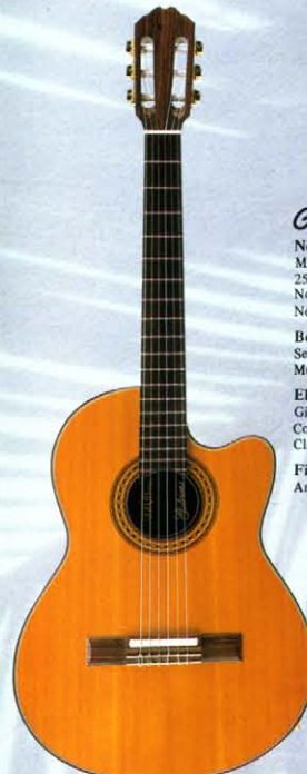
Chet Atkins CE

Chet Atkins CGP Chet Atkins Country-Gentleman (#350XT)