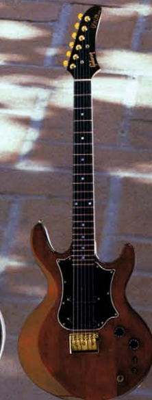
Chet Atkins CGP