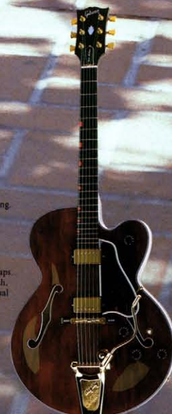
Chet Atkins Country-Gentleman