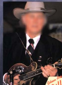
Gibson Artist Bill Monroe

Neck Specifications: One piece Curley Maple, Antique white neck binding. 13 3/4" scale, Ebony fingerboard, 29 nickel silver frets. Pearl dot position marker. Traditional artist shape peghead with pearl "The Gibson" and "Fern" inlay. Gold-plated pearl-button machine heads.